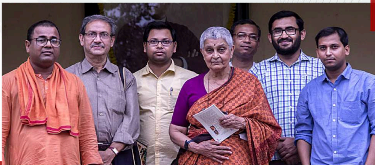
Gayatri Chakravorty Spivak with the Faculties

Sikshanamandira boasts a rich pool of eminent faculties of every discipline. Our faculties play an active role in conducting multifaceted researches in the field of Educational Studies both independently and under the umbrella of SWAMI VIVEKANANDA CENTRE FOR MULTIDISCIPLINARY RESEARCH IN EDUCATIONAL STUDIES - the apex research wing of Sikshanamandira. The availability of such collective teaching and research experience, makes sure that the transfer of knowledge to the students becomes fruitful and ineffaceable.