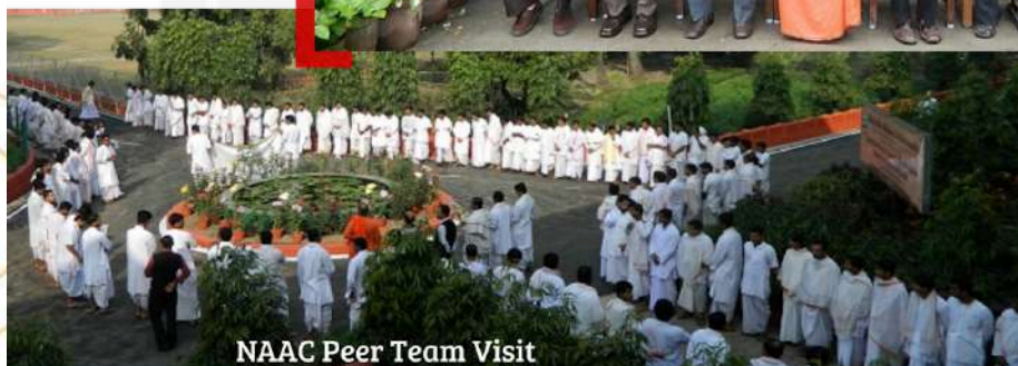
NAAC Peer Team Visit