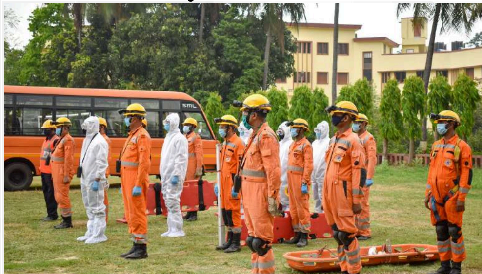
NDRF Disaster Management Drill