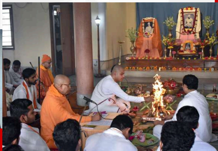
Vidyarthi Brata Homa