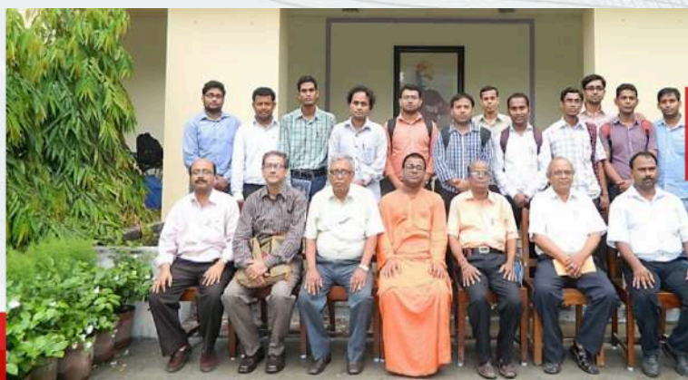
First M.Phil Batch