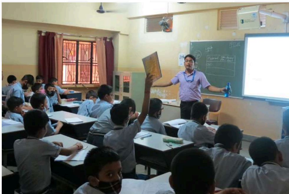
School Internship Programme