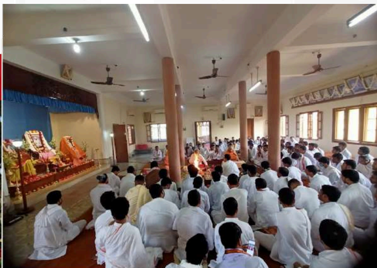
Hostel Prayer Hall